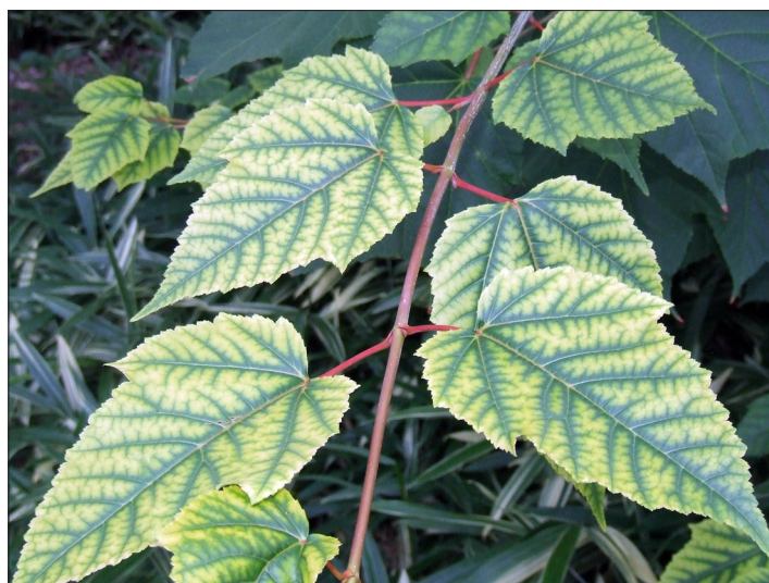
This striped maple is showing a deficiency caused by a high pH.

Products containing limestone or sulfur can help raise or lower soil pH, respectively. Be aware that too much of any product can work against an effort to improve a plant's growing environment. To quickly alter the soil pH, work the amendment into the soil to the depth of around 6 inches. Where this is not possible (as in established lawns, orchards, or landscapes), soil surface applications are the necessary. In this case, the resulting change will take one or more seasons.